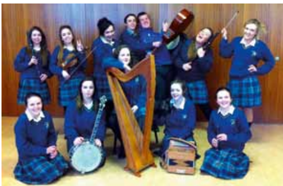
Coláiste Bhríde students participating in PURE MUSIC competition.

The PURE (Protecting Upland and Rural Environments) project is hosting a Multi Media Environmental Awareness Exhibition in the Courthouse Arts Centre in Tinahely on the 12th July which will run for a period of 3 weeks. The exhibition concentrates on the various multimedia projects PURE has produced to create environmental awareness, featuring 16 award winning short environmental animations, 7 environmental music videos, a short