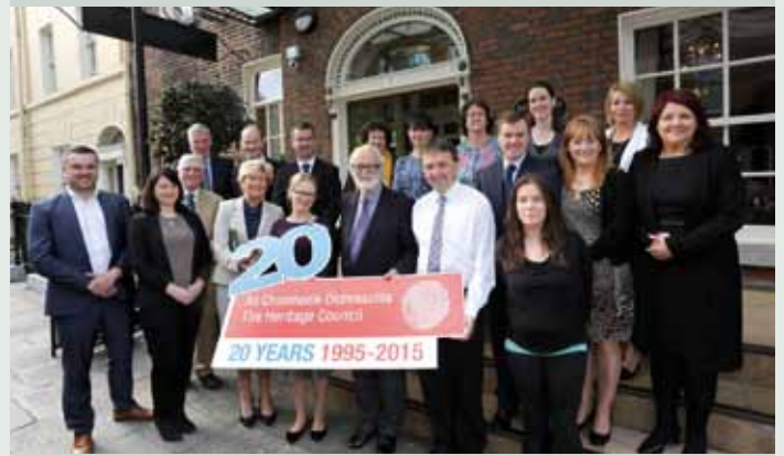
The Heritage Council staff and representatives of all heritage organisations who attended the Oireachtas Information Day at Buswells Hotel, Dublin.