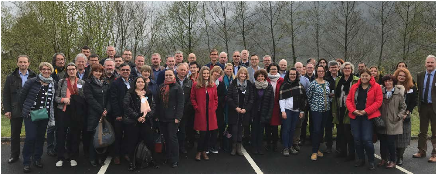
Members of the EU Delegation from across 22 member states who visited the Wicklow Uplands to learn more about the SUAS Pilot Project.