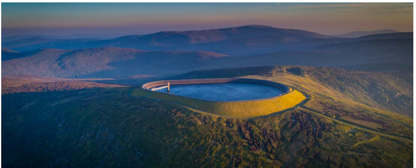
1) The stone-built 'valve' or 'draw off' tower on the lower Vartry Reservoir, constructed c.1865. 2) The upper Bohernabreena Reservoir constructed in the 1880's to provide a clean drinking water supply. Also in the photo is the outlet tower and spillway. 3) The Vallemount Bridge across the Poulaphuca Reservoir which was constructed following the flooding of the valley in 1940. 4) An aerial view of Turlough Hill's storage reservoir.