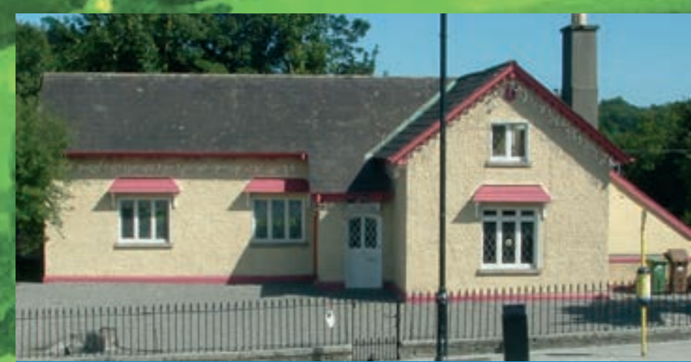
Powerscourt National School

The Ancient Order of Hibernians first registered a branch in Enniskerry in 1904 and leased this property from the Powerscourt estate in 1916. The rate for full membership in 1935 was 6 pence per week. Members could take part in the many social activities run by the club and receive benefits in times of trouble. The hall is still occasionally used as a meeting and lecture room. Originally a shop, the frontage is the only one in the village which has not been modernised.