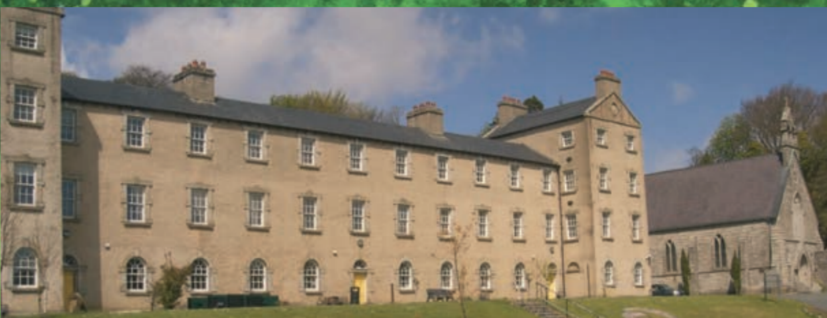
The Glencree Centre for Peace and Reconciliation

Knocksink Wood is a Special Area of Conservation. It is situated in the valley of the Glencree River which winds its way over granite boulders along the valley floor. The steep sides of the valley are covered with mature deciduous woodland including species such as oak, holly, hazel, ash, alder and beech. There are walking trails alongside the river and throughout the woods which are suitable for gentle strolls.