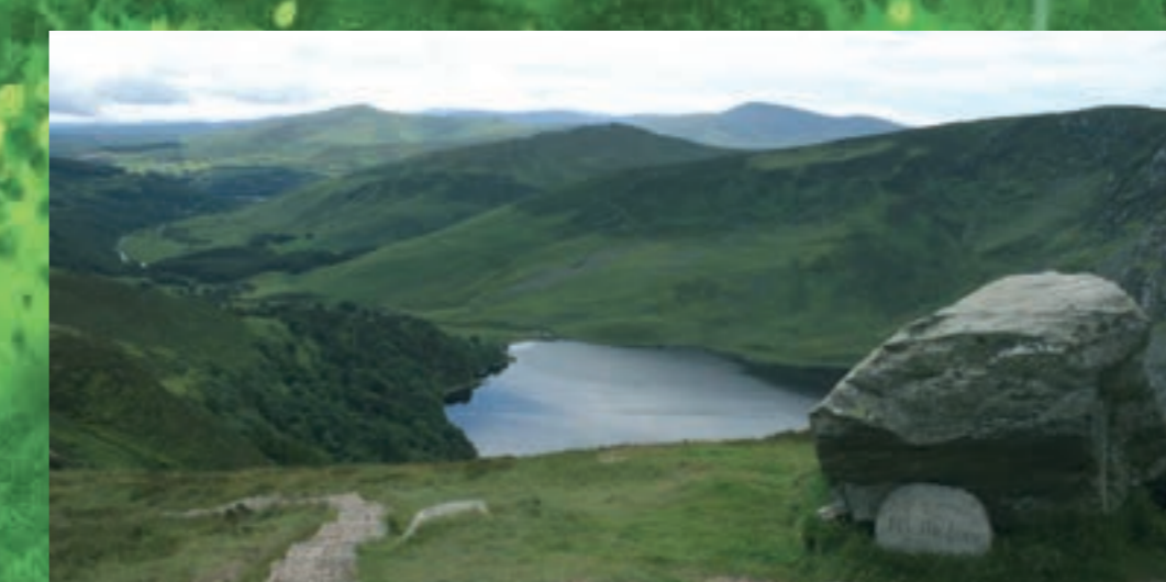
The Wicklow Way

The An Óige hostel at Knockree (7.5km from Enniskerry) was originally a farmhouse called Lackens and has been a hostel since the 1940s. It was extensively refurbished in 2008 and boasts stunning views of the Glencree Valley and walks along the Glencree River. It is ideally situated for those walkers travelling on the Wicklow Way (which passes the door), or for an activity based holiday with walking, fishing, horse riding, and water sports in the surrounding countryside.