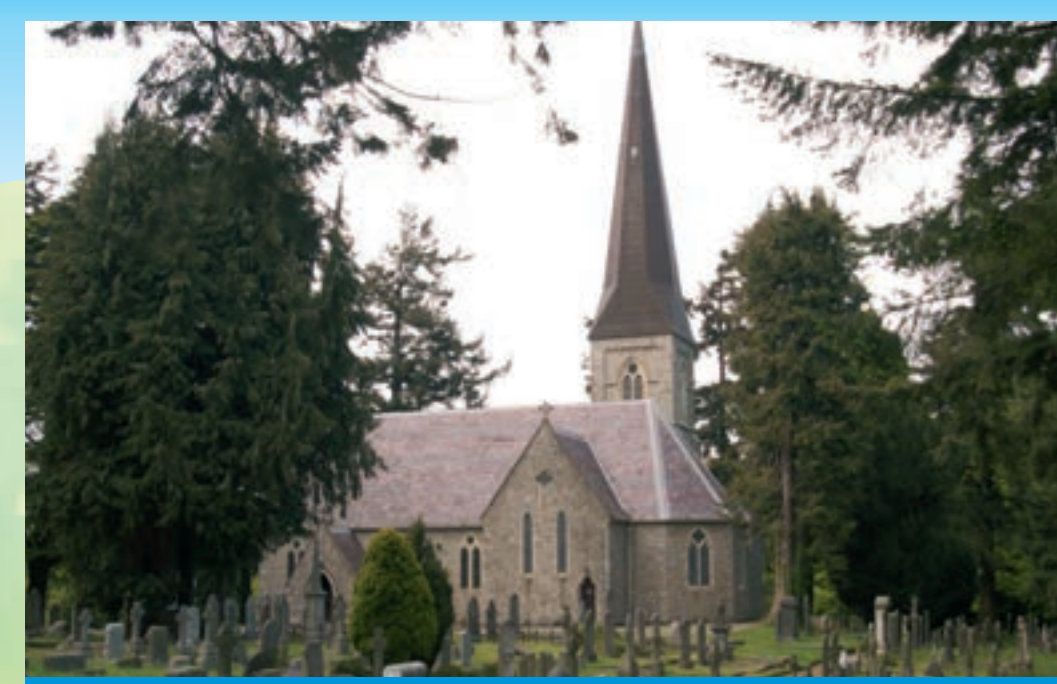
St Patrick's Church